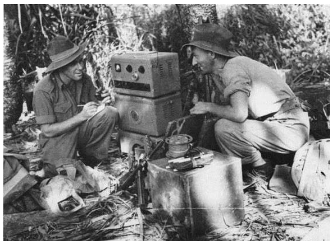
A coast-watching radio at work in the jungle. This one, near Dobadura on the Papua New Guinean mainland, north of the Kokoda Track, shows how many parts there are to the machine and how difficult it would have been to transport it.