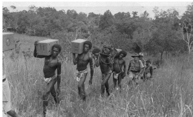
Coastwatchers moving their radio equipment through the kunai grass. This group had just landed near Oro Bay on the PNG mainland (AWM 127577)

To start with, radio messages were sent in Morse code using an early encryption method called 'Playfair', which had been developed by Charles Wheatstone in 1854. It encoded two letter groups, which made it more secure than single letter substitution, and had been used extensively by the British in the Boer War and in WWI because it required no special decryption equipment and was reasonably fast. It was later replaced with a code specially developed by 'Ferdinand' cryptographers and called 'Bull'. When Japanese forces were observed massing for attacks, it was not uncommon for 'Ferdinand' messages to be sent in plain language in order to save precious time and provide the defenders with the maximum time to prepare and counter-attack.